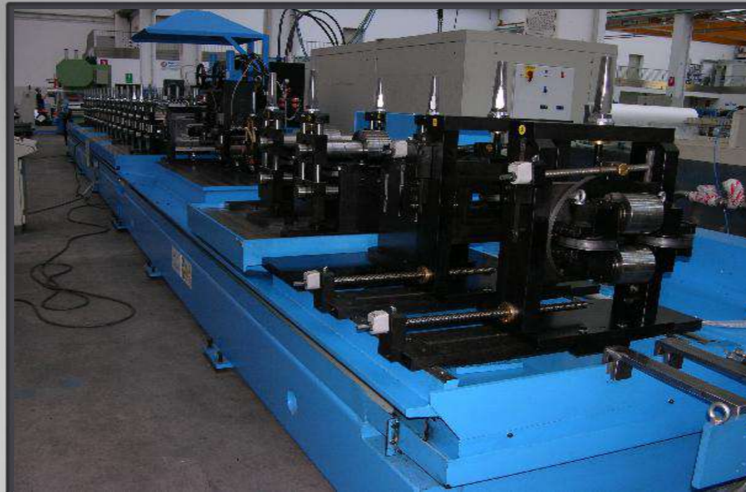
Desk beam roll forming