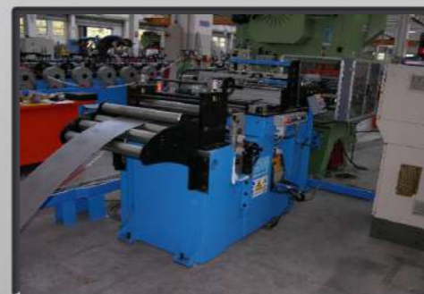
Strip introducing group