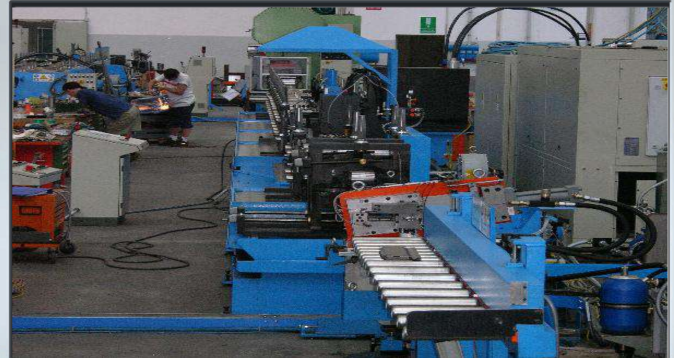
Machine for beam for desks