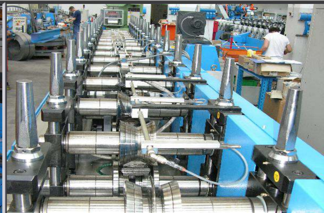
Beam forming rolls