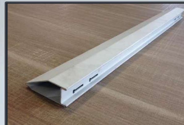
Beam for desks